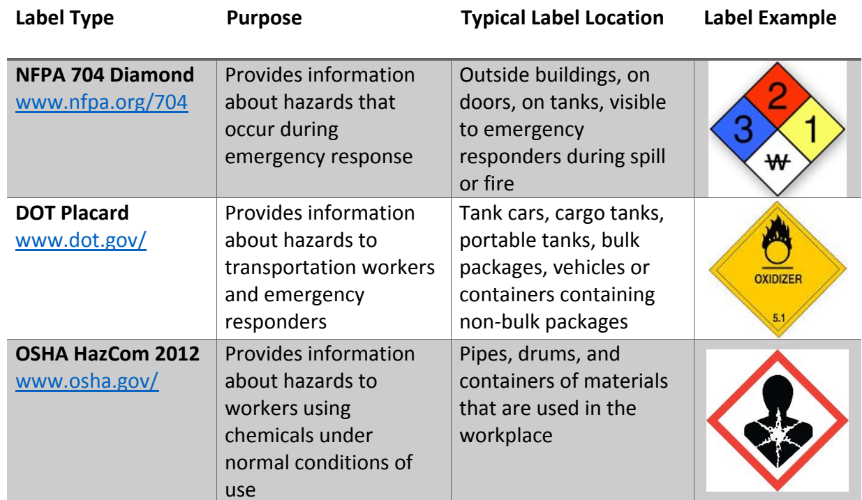
Table 1. NFPA, DOT and OSHA Placard and Pictograms

There are several widely used systems for labeling hazardous materials. Each has a specific purpose and it is important to recognize the differences between each. Table 1 provides a brief summary of the purpose and use of three common labeling systems used for hazardous materials. Note that you may see more than one label on a container depending on the situation. (See Question 11 for additional information on the differences between OSHA HazCom 2012 classifications and NFPA 704 ratings)